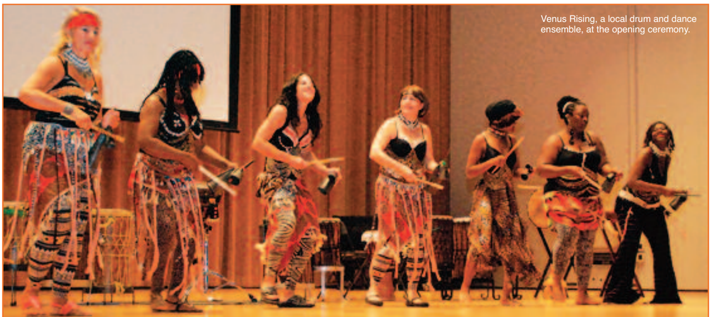
Venus Rising, a local drum and dance ensemble, at the opening ceremony.