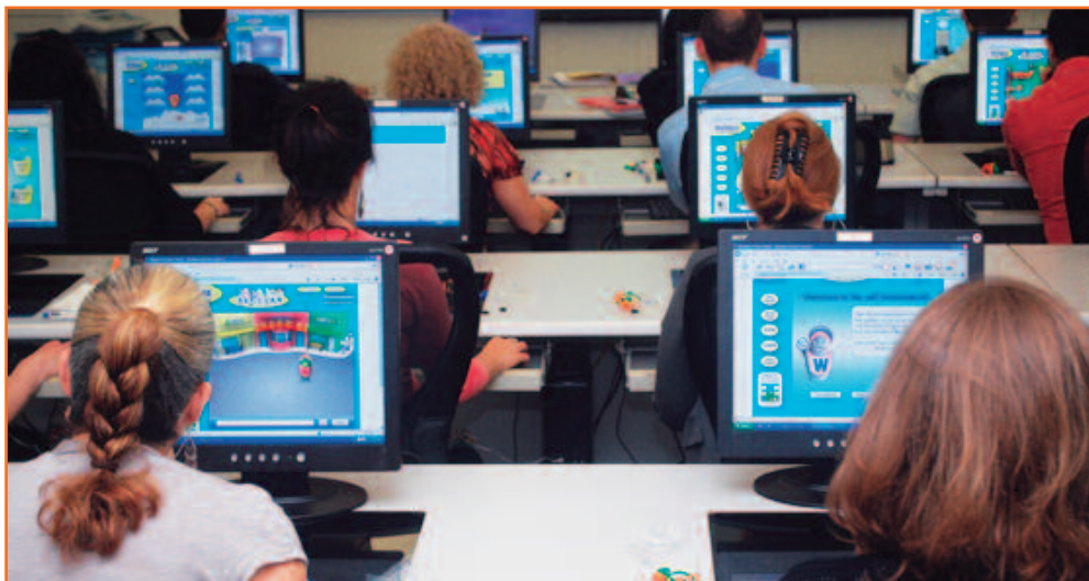
Playing the Wellness in Your Hands game.